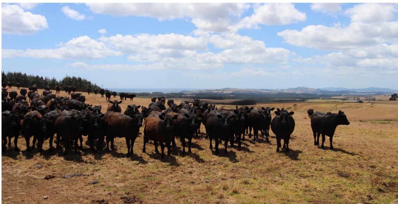
Drought, Takou Bay area

There is an opportunity to support early drought responses and long-term water resilience by providing better information, and through the use of models such as drought forecasting. We could include research on the interaction between population growth, water extraction demand, groundwater recharge, and sea level rise to improve understanding of water availability in coastal townships and agricultural regions. Ongoing investments in infrastructure to improve the reliability of town water supplies will be necessary to mitigate drought risk. In addition, demand reduction measures, including community education, are likely to be required.