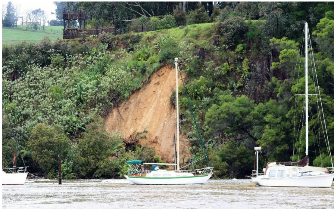
Coastal slip at Kerikeri Basin, below pā site