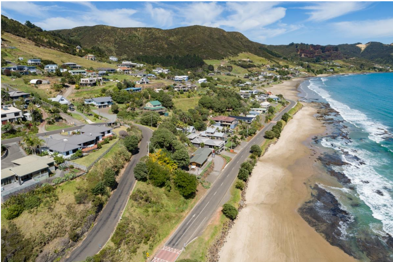
Tasman Heights, Ahipara

Most coastal communities do not have town water supplies, with households relying on tanks and shallow bores. Both of these sources of water will come under pressure with climate change due to increased drought and sea level rise. These communities are also often reliant on septic systems. Rising groundwater levels could impact on the effectiveness of waste disposal systems. Sea level rise will impact coastal agricultural areas as groundwater salinity impacts the ability to draw water for stock or irrigation, and low-lying land is affected by salinity.