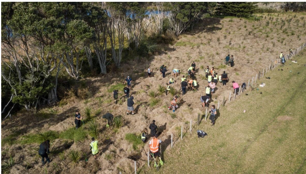
Riparian planting by a dune lake