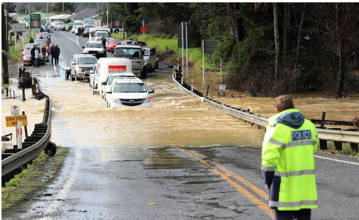
Turntable Hill flooding

While climate change projections are built into specifications for new assets, the existing stock of aging infrastructure is unlikely to be able to cope with the combined pressures of climate change, population growth and urban redevelopment. Retrospective upgrades of urban wastewater and stormwater networks to meet future needs are often prohibitively expensive.