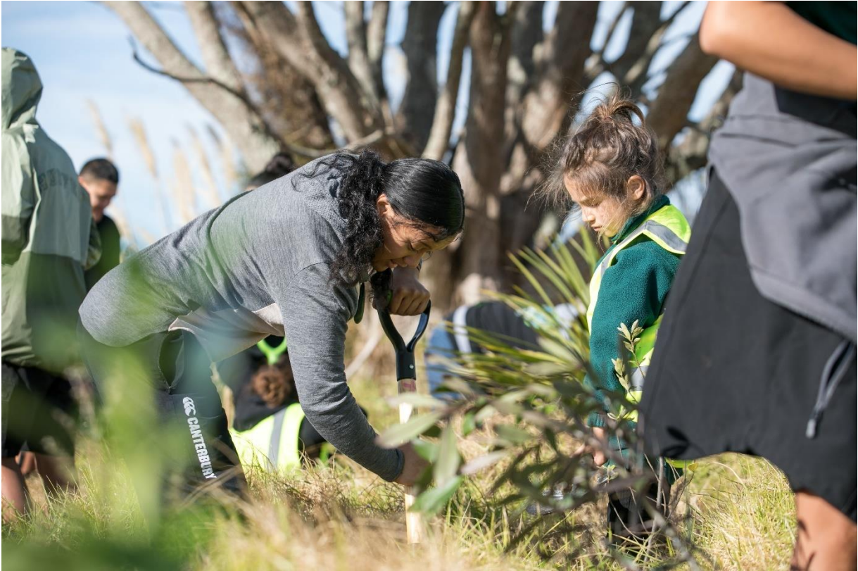
Enviroschools planting at Lake Waiporohita. See https://enviroschools.org.nz/